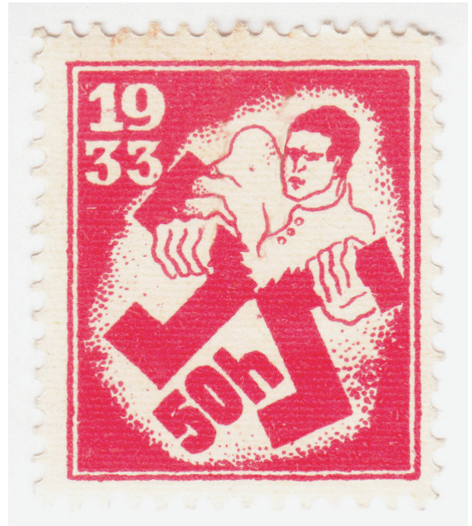
5) National Archives, Police Headquarters in Prague II – Presidium