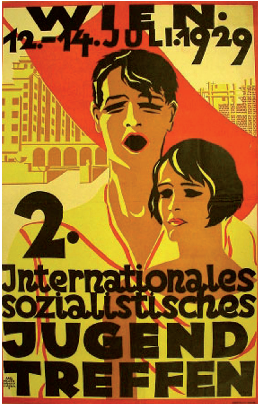
4)